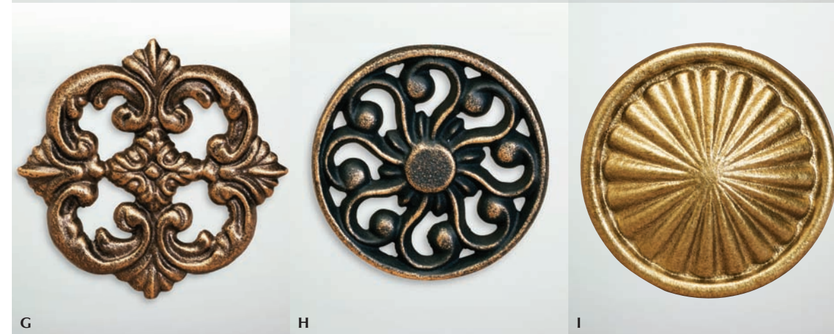
A R106 3⅞"D 270G Mahogany Rust with Gold B R102 3⅝"D 330 Bronze with Black C R24 3"D 102 Antique Venetian D R23 3½"D 250 Platinum E R21 2⅞"D 107 Bronze with Gold & Gray F R103 4½"D 155 Antique G R17 4¾"D 155 Antique H R16 3"D 110 Flat Black with Gold I R22 3¼"D 133 Antique Brass