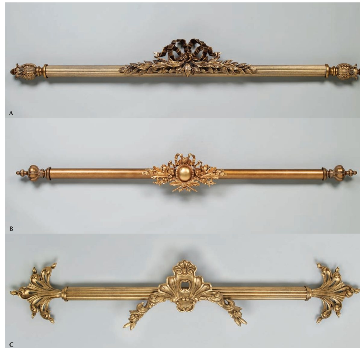
A C6 crest 26¼"W x 7½"H 200 Walnut Gold with Gray RF1000 finials 200 Walnut Gold with Gray 225WR pole 200 Walnut Gold with Gray