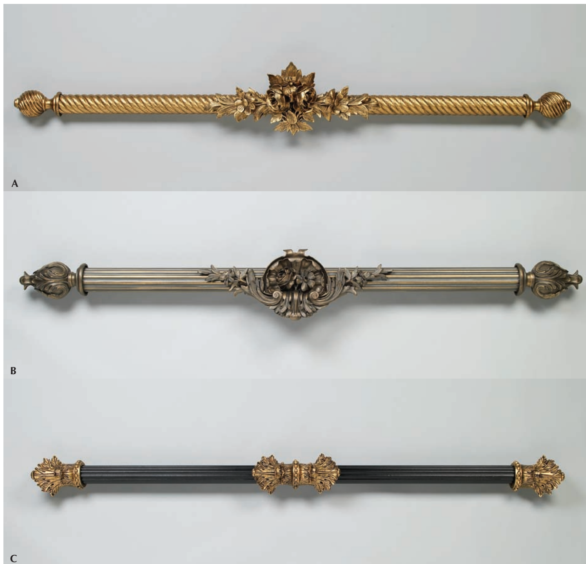
A C1 crest 20"W x 8¾"H 155 Antique WW201 finials 155 Antique 225TR pole 155 Antique