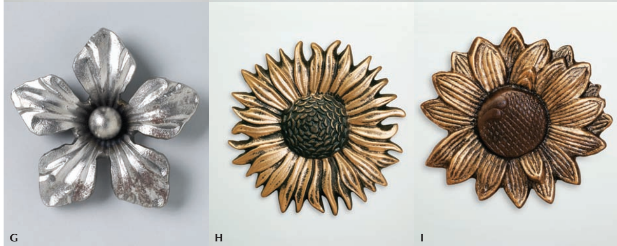
A RMC14 4"D 330 Bronze with Black B R2 4½"D 106 Bronze with Gold C REC73 2¾"D x 7/8"L 107 Bronze with Gold & Gray D R8 5"D 270G Mahogany Rust with Gold E R107 5¼"D 107 Bronze with Gold & Gray F R104 4¼"D 250 Platinum G R105 3½"D 100 Polished Steel H R101 5½"D 270G Mahogany Rust with Gold I RDSY4 4¾"D 270G Mahogany Rust with Gold RDSY2 2½"D